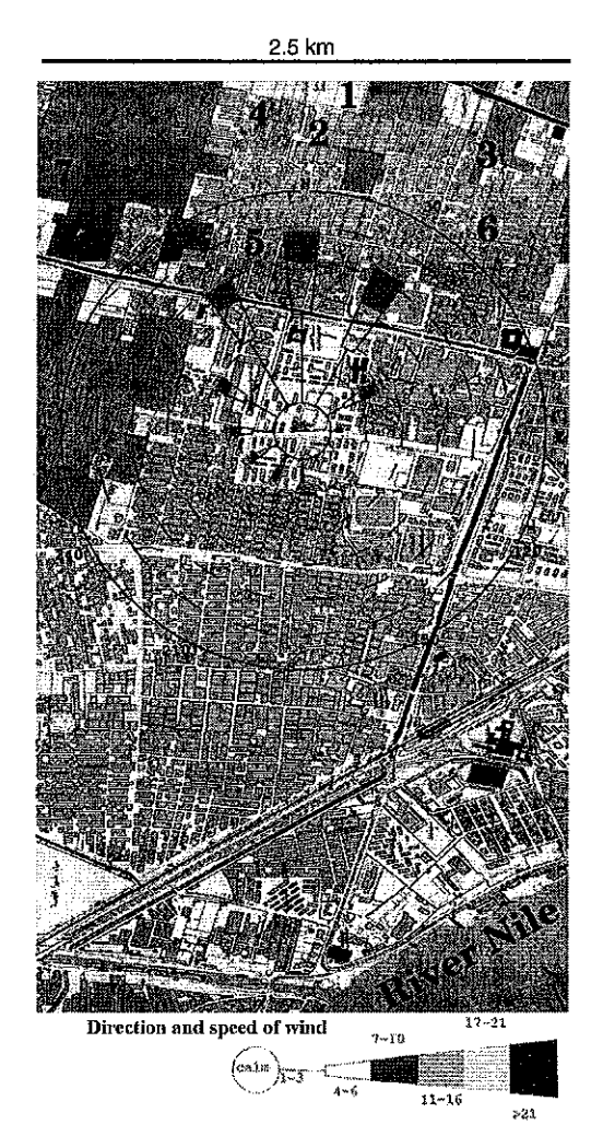
Figure 1 Map of Shubra El-Kheima city with superimposed direction and speed of wind. Sampling areas: (1) Asbestos plant (Sigwart store); (2) El-Wehda El-Arabia; (3) Manshiyat El-Horriya; (4) Ezbet Rostom; (5) Ezbet Osman; (6) Manshiyat El-Gadida; (7) Manshiyat Abdel Moneim Riad

the 2000 census population data were obtained from the Egyptian Central Agency for Public Mobilization and Statistics. All sampling sites were located within 2 km of the asbestos plant. El-Wehda El-Arabia area